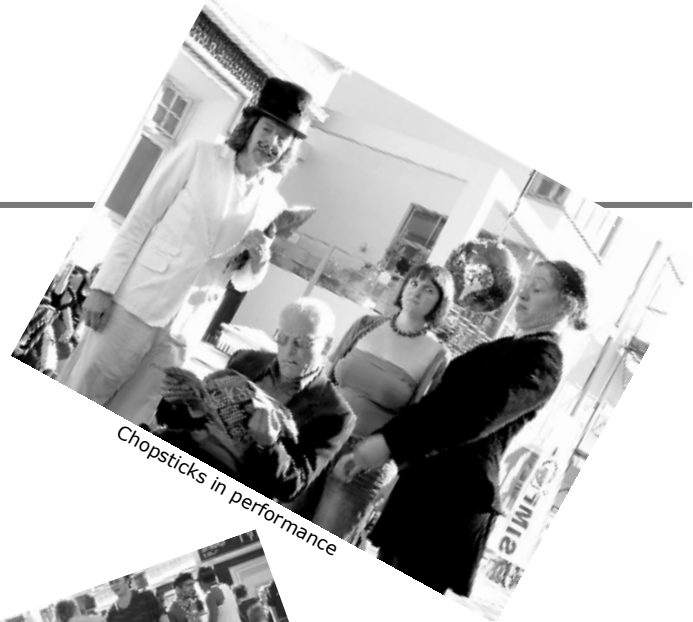
Chopsticks in performance