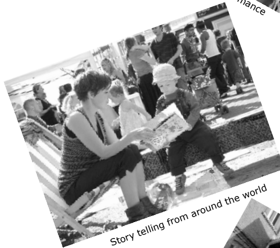
Story telling from around the world