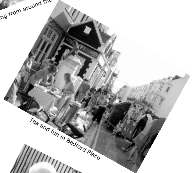
Tea and fun in Bedford Place