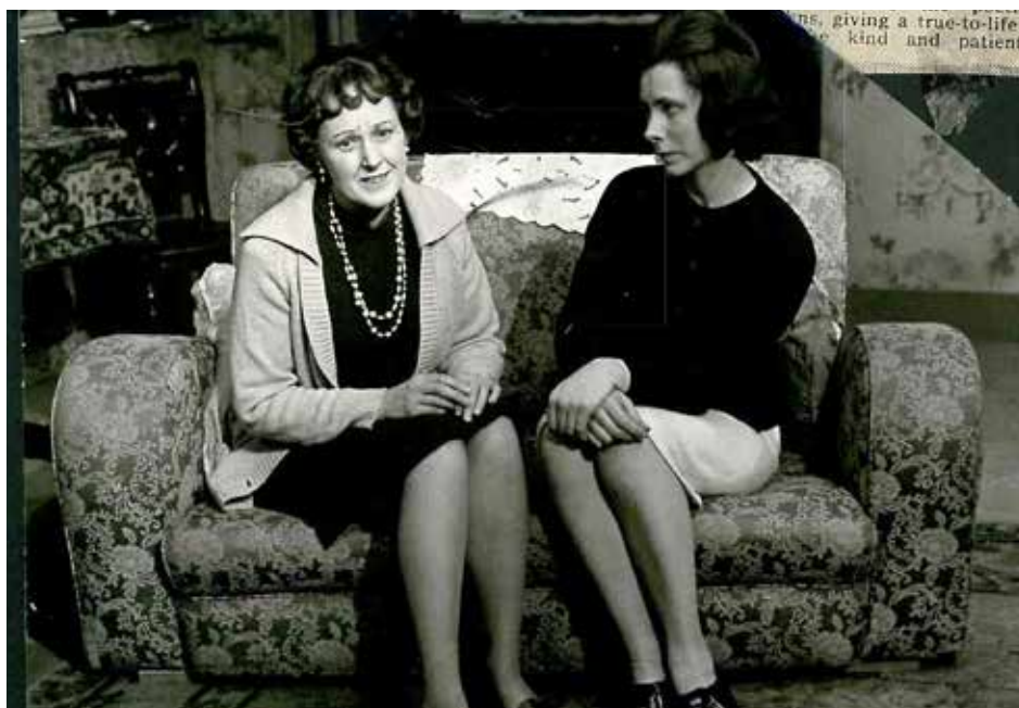
Photos from NVT's 'The Cactus Garden' February 1973

The Launch of the New Season Social on 17 April will also see the completion of the first phase of our Archives project, which has been in progress over the last year or so.