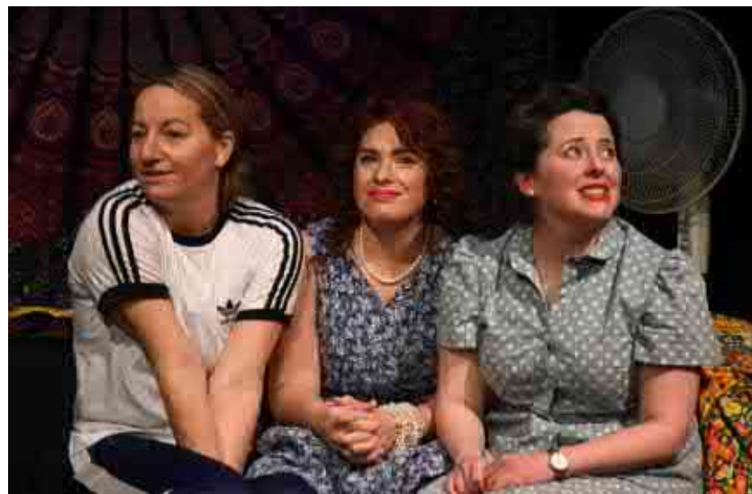
LEFT AND PAGE 1